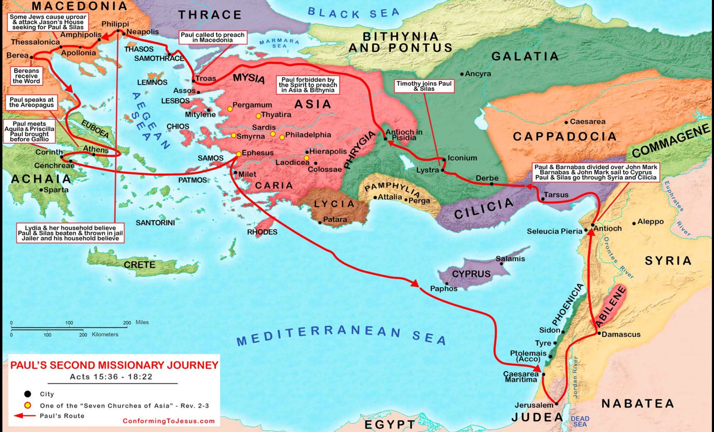
PAUL'S SECOND MISSIONARY JOURNEY Acts 15:36 - 18:22 ● City ● One of the "Seven Churches of Asia" - Rev. 2-3 ← Paul's Route ConformingToJesus.com